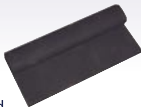
Non-Slip Rubber Mat