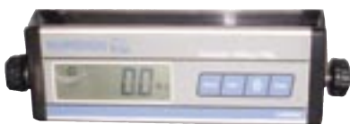
Wall Mounted Indicator