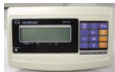
JAC 101 Electronic Indicator with a large easy to read display