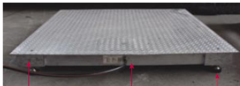
Protection end plate