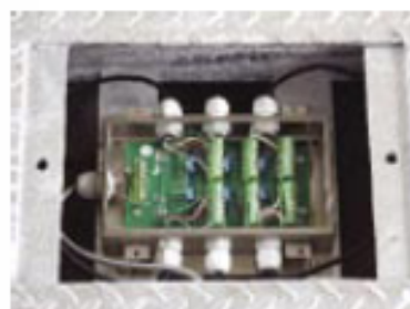
Stainless steel junction box located inside base. Entry is from top of scale.