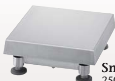
Small 250 mm × 250 mm