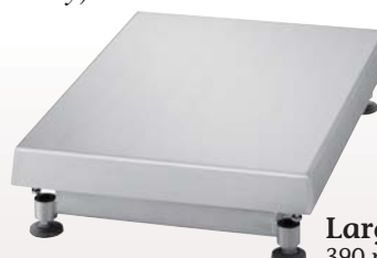
Large 390 mm × 530 mm