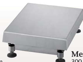
Medium 300 mm × 380 mm